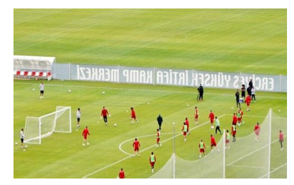
Figure 1: Mount Erciyes High-altitude Center