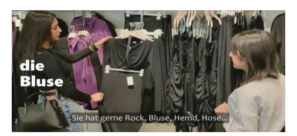
Photograph 2. A section from the shooting of the digital content scenario

As can be seen from the screenshot above, almost all possible life shopping situations in digital content have been animated and the abstract learning inputs have been embodied through the scenario. German expressions and linguistic uses in digital content are both voiced and written. Thus, students were able to experience both the pronunciation and writing of German expressions.