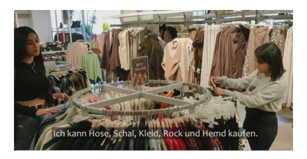
Photograph 1. A screenshot from digital content

As can be seen from the screenshot taken from the digital content above, two friends are looking at clothes in a clothing store, and they talk about the subject such as "ich kann Hose, Schal, Kleid, Rock und Hemd kaufen".