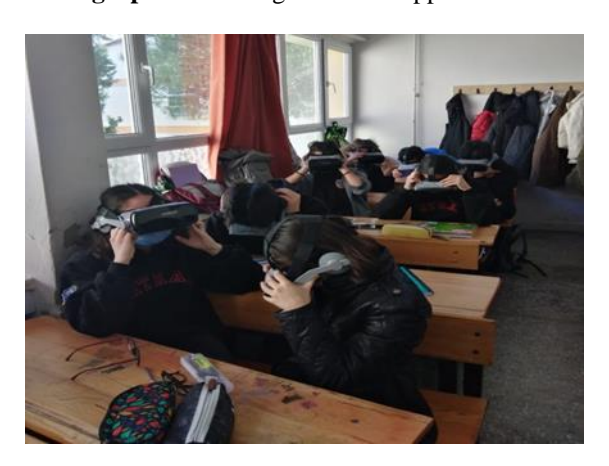
Photograph 3. An image from the application made with virtual glasses

Above is an image of the practice made with virtual glasses in the classroom environment. Students were able to experience the digital content that they could watch in three dimensions, regardless of the environment. Each student wearing virtual glasses had the opportunity to go out of the classroom and take a tour as if they were actually shopping in a shopping mall. Since the teaching process gains individuality after virtual glasses are put on, the possibility of experiencing other undesirable behaviors outside the classroom will be prevented. In this application, every student now has to focus on the content they encounter. Afterwards, a post-test was administered to the participants. Findings related to the study are presented below.